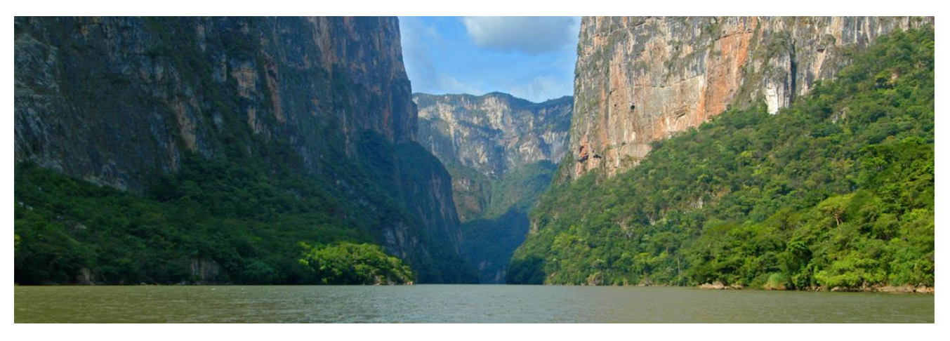
Private transfer to San Cristóbal de las Casas via the Sumidero Canyon including a boat

En route you will have a boat ride through Sumidero Canyon. Created by the mighty Rio Grijalva, you will journey by boat through the Sumidero Canyon with its walls towering 2500 feet above you. A wealth of wildlife and interesting caves that can be viewed on your way through this spectacular canyon.